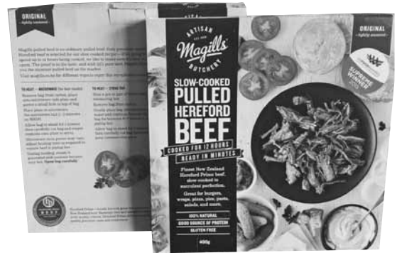
Pulled Beef Packaging.