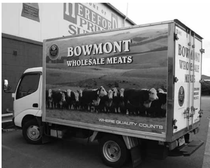
Each side of the delivery truck is different – creating a very striking and impressive sight on the roads of Southland.