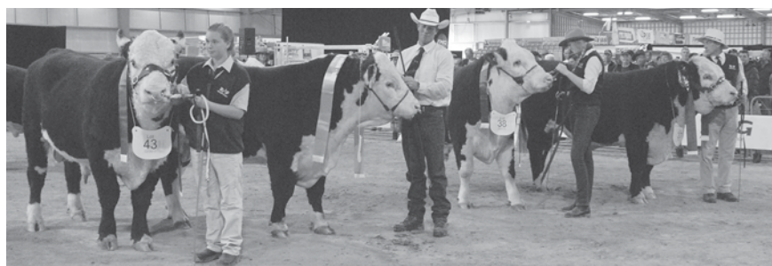
Outstanding line-up of Hereford led entries