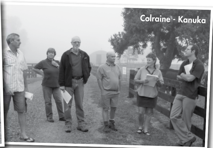
Colrairie - Kanuka

Despite being in drought mode, all of the Hereford studs visited on the 2014 National Herd Tour had very sound, well grown Hereford cattle on display – a credit to all studs involved.