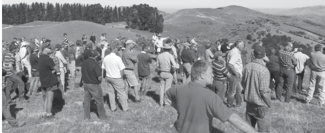
Strong crowd attends Importance of Beef Cow Field Day.

Close to 200 farmers turned out to the Mendip Hills Station, Importance of the Beef Cow field day recently.