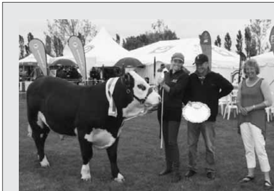
MEAT & WOOL CUP - Supreme Beef Animal in the Show. Glacier John 372