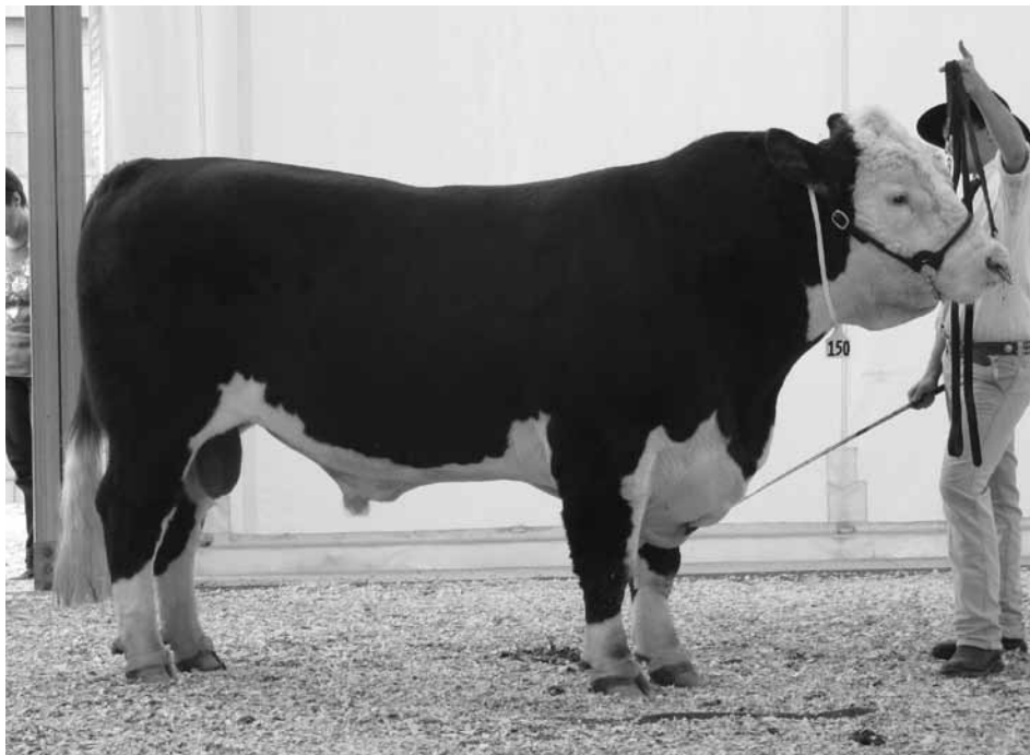
Awhea Immense Grand Champion Hereford. Meat and Wool Cup Winner - Supreme Beef Animal in the show.