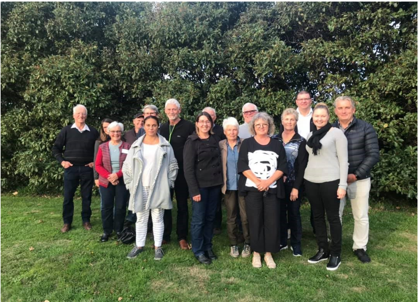
Some of our members at the AGM in Feilding . May 2019