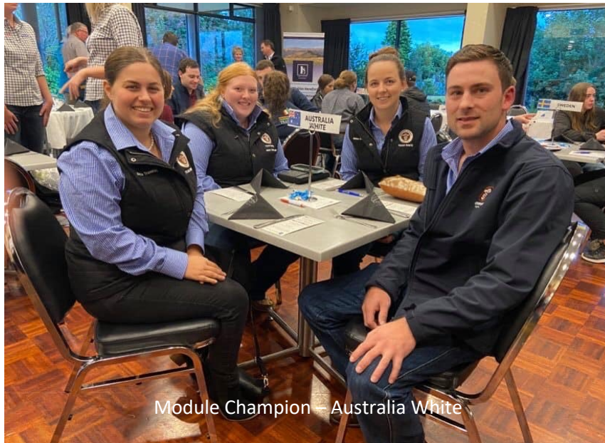
Module Champion – Australia White